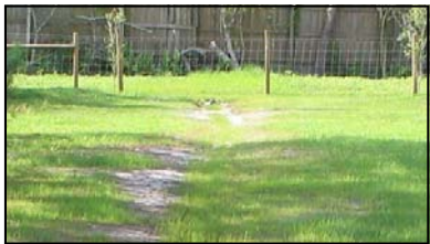
Grassy areas and flower beds help filter pool water before it reaches the storm drain.